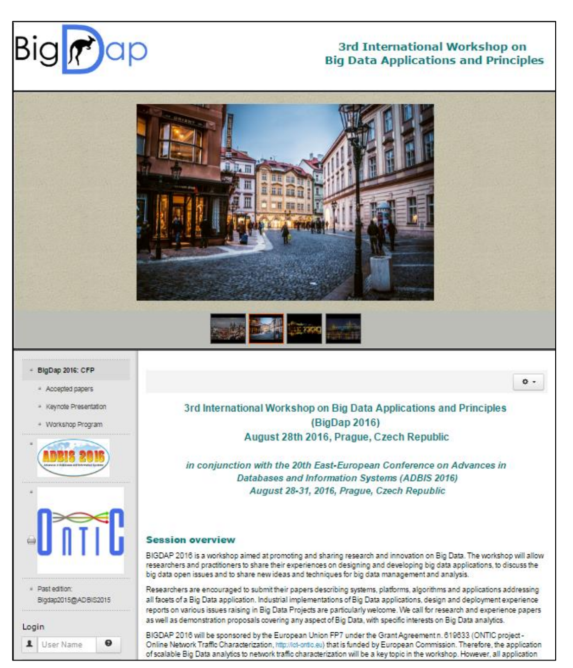
Figure 1: BigDAP16 web page

In the manner of the ONTIC portal, the BigDAP website contains links to the communication channels for diffusion and feedback (linking from/to the project's website and the project's twitter page).