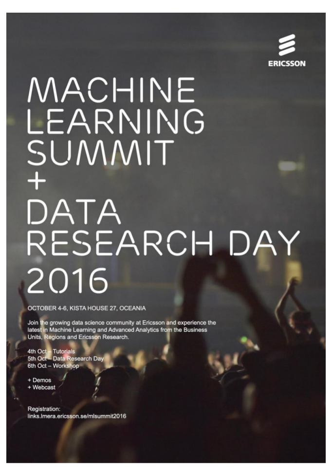
Figure 7: Ericsson Machine Learning Summit leaflet

The promotion of the ONTIC findings within product organizations has also been pursued focusing around the Ericsson Analytics Implementation Architecture (AIA). The Analytics Implementation Architecture is the part of the Ericsson Architecture that aims to enable reuse of analytics applications and components in order to increase efficiency in the development of products, services and research. Ericsson AIA promotes the usage of integration and extension points while it promotes the usage of a common SDK in order to combine or extend compliant assets. The Policy Governance Function and the QoE Analytics Function implemented in the project -based on ML algorithms by Polito and the DellEMC dataset- is currently being added to the AIA catalogue. As a consequence, any unit within Ericsson can benefit from ONTIC findings and expertise.