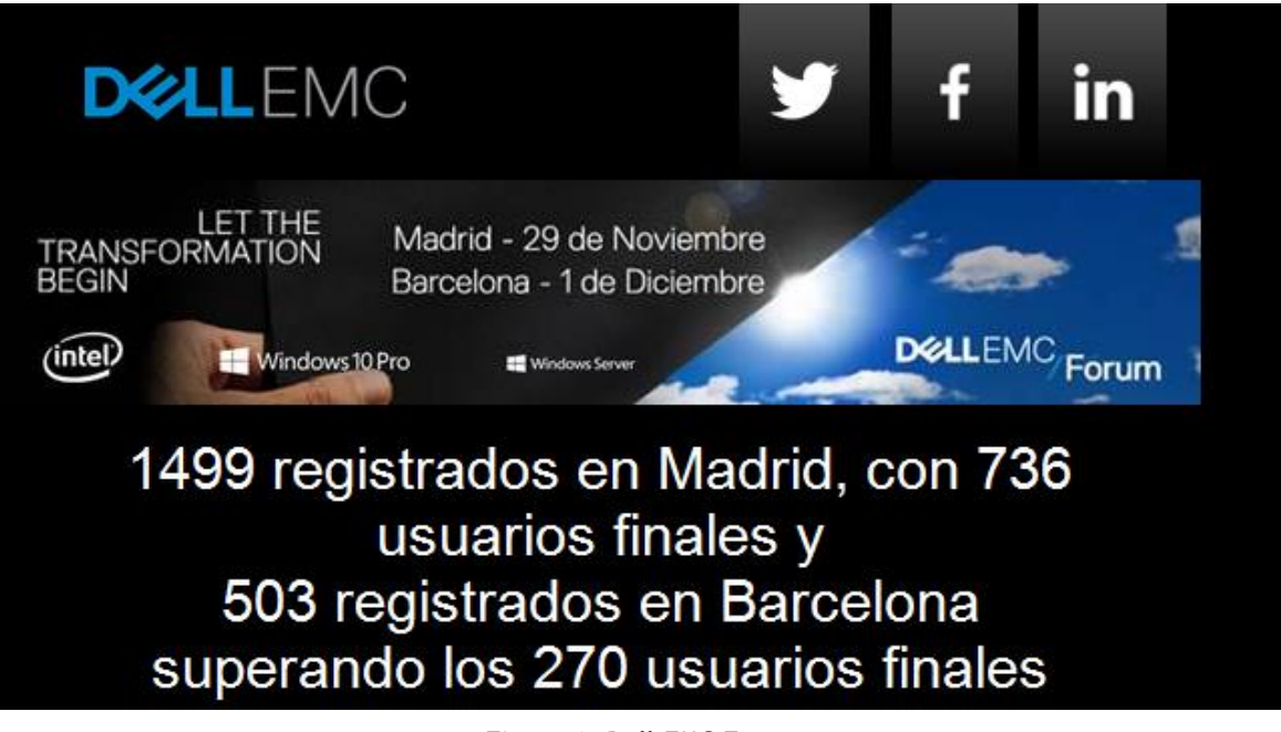
Figure 6: Dell-EMC Forum

In addition to the internal quarterly sessions, this year we have leveraged the event DELL EMC Forum, organized in Madrid the 29th of November, and in Barcelona the 1st of December, to show our customers and partners the ONTIC project work and results; EMC (now DELL EMC after the acquisition of EMC by the DELL company) organized an event for customer and partners, called DELL EMC Forum, to present and share with them the latest news of products and solutions of the company. This year, Professional Services had a stand in both events, and we took the opportunity to present the ONTIC project and the Use Case prototype to all partners and customers who came to the stand.