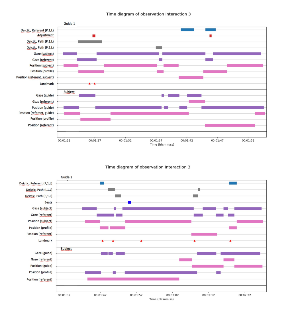
Image 4: Time diagrams of the same interaction for Guide1 (up) and Guide2 (down). We can observe some similarities in gazes and positions. We also notice the use of landmarks.

We can notice that Guide2 uses much more landmarks than Guide1, whereas Guide1 use metaphoric gestures when Guide2 do not. In reality, we find similarities between the two guides (as we see for example on Image 2), but we also observe subject-dependent differences at the level of the gestures used (shape, orientation, type), the mutual gaze and the use of landmarks. Surprisingly, the most used landmarks are not the big stores (e.g. Prisma), but the doors (e.g. A door), "Central Park" (a big square at the center of the mall) and the "old town" (section on Ideapark just behind the info desk). Furthermore, the guides don't use street names to indicate the path to take, because they are not clearly visible. The guides use landmarks in their speech when the referent is not visible from where they are, and when they explain to the subject the path to get to the desired location (route perspective). Landmarks are indeed much more rarely used when they indicate the direction of the referent directly (survey perspective).