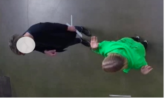
Image 2: The guide uses her both hands simultaneously. On the right, the guide uses a metaphorical gesture with her both hands.

When the guide wants to insist on the referent's distance (e.g. when the referent is located at the end of a corridor, or if it is the last store ...), the signal is adjusted and the guide presses on his gesture, "waving" his hand up and down.