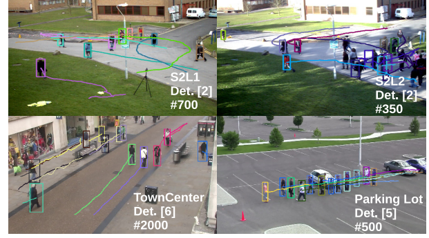
Fig. 2. Illustrations of some of our tracking results.

ability of the specific dictionaries, collaborative representations significantly improve the tracking results without any advanced features and seem to better differentiate targets.