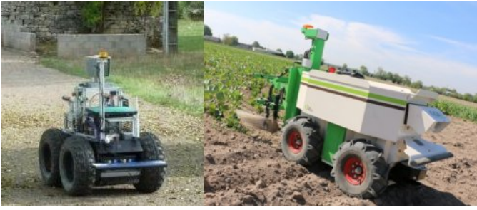
Fig. 2. Mana from LAAS (left) and Oz from Naïo Technologies (right)

we use GAs, which mutation or cross-over operators should we apply on the generation parameters?