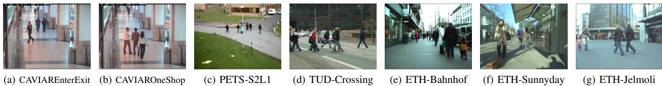
Fig. 2: Sample images taken from each dataset.

performance on the different datasets. It will later be used as a basis to compare performance with detector alone and with tracker incorporated. LDCF records the highest recall and precision in three and six of these datasets respectively. RCNN and DPM demonstrate the highest recall in the remaining four datasets. HOG-SVM and DeepPed show the worst recall rates. All in all, CAVIAR-OneShop and ETH-Jelmoli prove to be very difficult leading to very low recall rates (57% and 56% best case scenarios respectively).