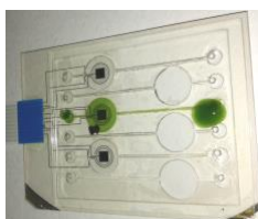
Fig.1: Lab-on-chip electrochemical biosensor