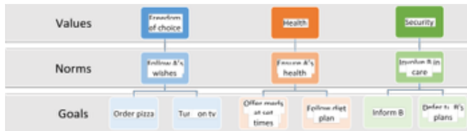
Figure 2. Design for Values for the scenario.

values, both enforcing as demoting those values. In the same way, goals can be associated with several norms and as such contributing to different values.