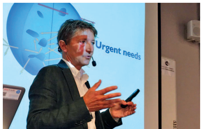
Figure 4. IMBioC 2017 keynote speaker Prof. Mikael Elam.