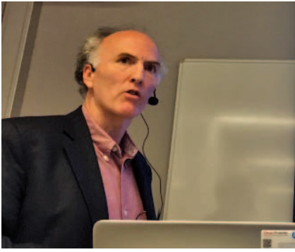
Figure 5. IMBioC 2017 keynote speaker Paul M. Meaney.