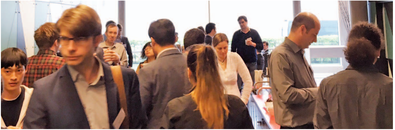
Figure 9. A coffee mingle at IMBioC 2017.

from 15 different countries participated in the conference. We are confident that all left with very positive impressions