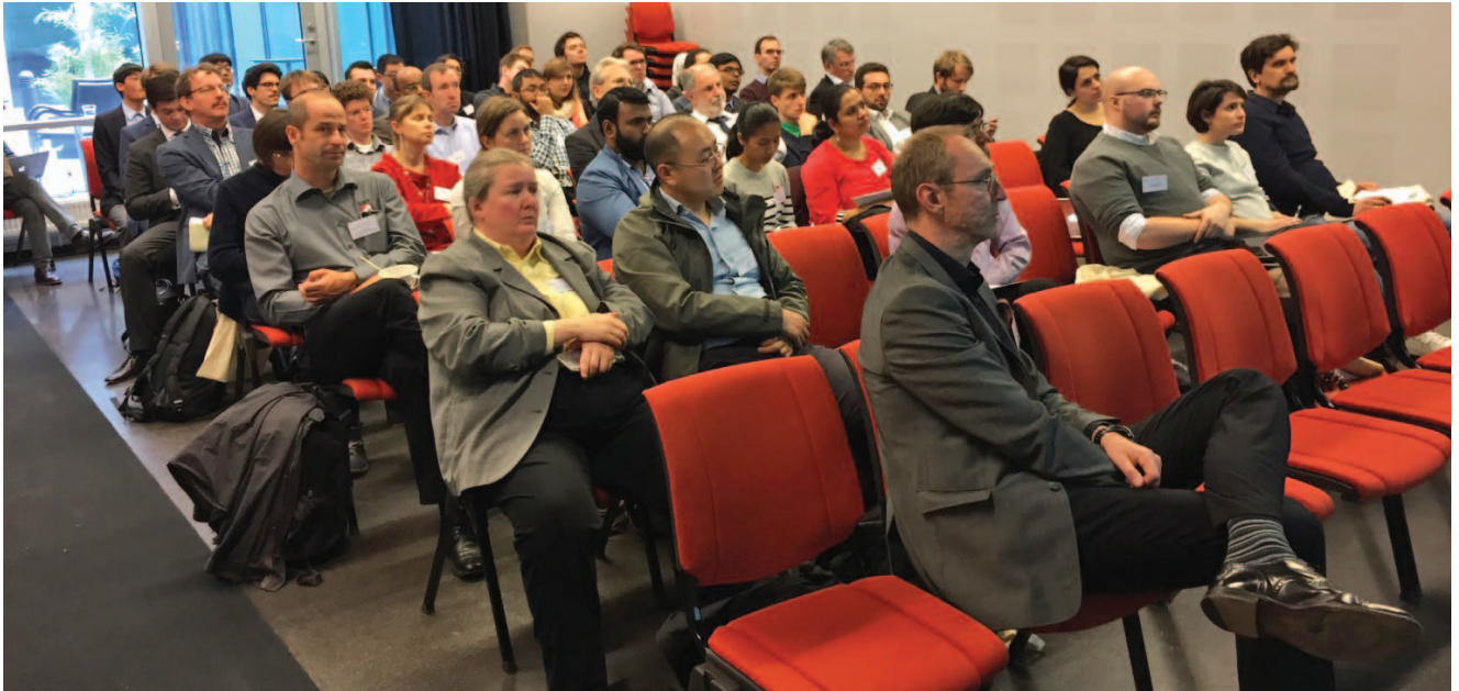
Figure 2. Attendees listening to a presentation at the conference venue.

The decision to merge these conferences meant establishing a novel conference format. Therefore, IMBioC brings together experts from different communities such as microwave engineering, biology, and medicine as well as academia and industry. Its alternating worldwide venues will foster international visibility for state-of-the-art technologies and applications in the biomedical field.