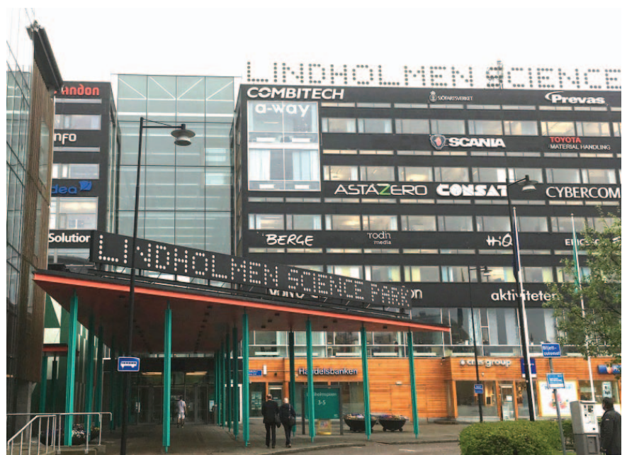
Figure 1. The conference venue at the Lindholmen Science Park in Göteborg, Sweden.

Workshop Series on RF and Wireless Technologies for Biomedical and Healthcare Applications (IMWS-Bio). Because the established BioWireless conference was colocated during MTT-S Radio & Wireless Week, its venue was always in the United States. In contrast, IMWS-Bio was created as a small international workshop series with alternating venues around the globe (former sites include Singapore, London, and Taipei).