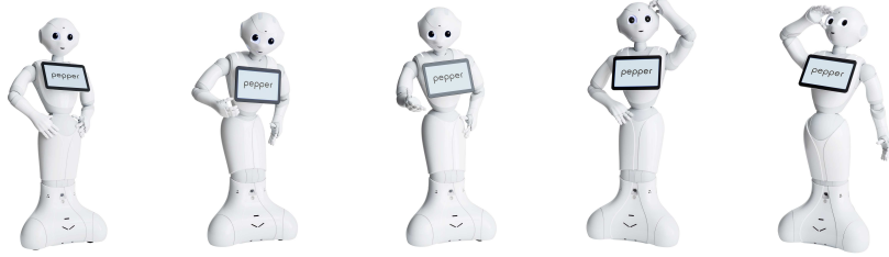
Fig. 2: Pepper robot (Images © SoftBank)

The high-level architecture of the MuMMER system is presented in Figure 3. As shown in this diagram, the technical developments will fall into four main classes: audiovisual processing, social signal processing, interaction management, and interactive task and motion control. In the remainder of this section, we summarise how we will develop state-of-the-art components to address each of these tasks.