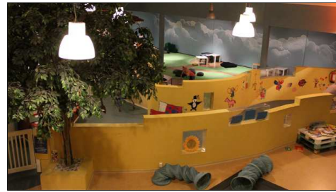
(b) Pii Poo Cultural Centre