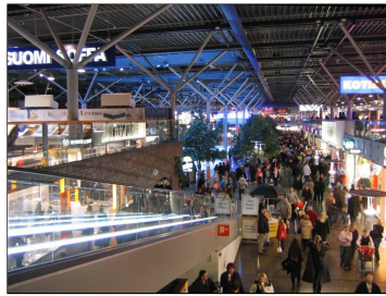
(a) Ideapark shopping mall