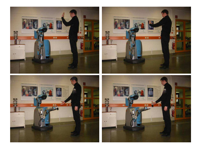
Fig. 1. Gestures with similar kinematics but different functions. Top row: HELLO (left) an interactional gesture (class 4) is similar to STOP (right) a conventional symbol (class 3). Bottom row: PASS OBJECT (left) is similar and TAKE OBJECT are both multifunctional interactional (class 4) and manipulative (class 1) gestures. Activity and situational context – e.g. stage of interaction and current activity (top row), or location of manipulandum, here a bottle (bottom row) – are be used to disambiguate between such kinematically similar gestures.

Multimodal and voice analysis can also help to infer intent via prosodic patterns, even when ignoring the content of speech. Robotic recognition of a small number of distinct prosodic patterns used by adults that communicate praise, prohibition, attention, and comfort to preverbal infants has been employed as feedback to the robot's 'affective' state and behavioural expression, allowing for the emergence of interesting social interaction with humans [3]. Hidden Markov Models (HMMs) have been used to classifying limited numbers of gestural patterns (such as grasps or letter shapes) and also to generate trajectories by a humanoid robot matching those demonstrated by a human [2]. Multimodal speech and gesture recognition using HMMs has been implemented for giving commands via pointing, one-, and two-handed gestural commands together with voice for intention extraction into a structured symbolic data stream for use in controlling and programming a vacuuming cleaning robot [8]. Many more examples in