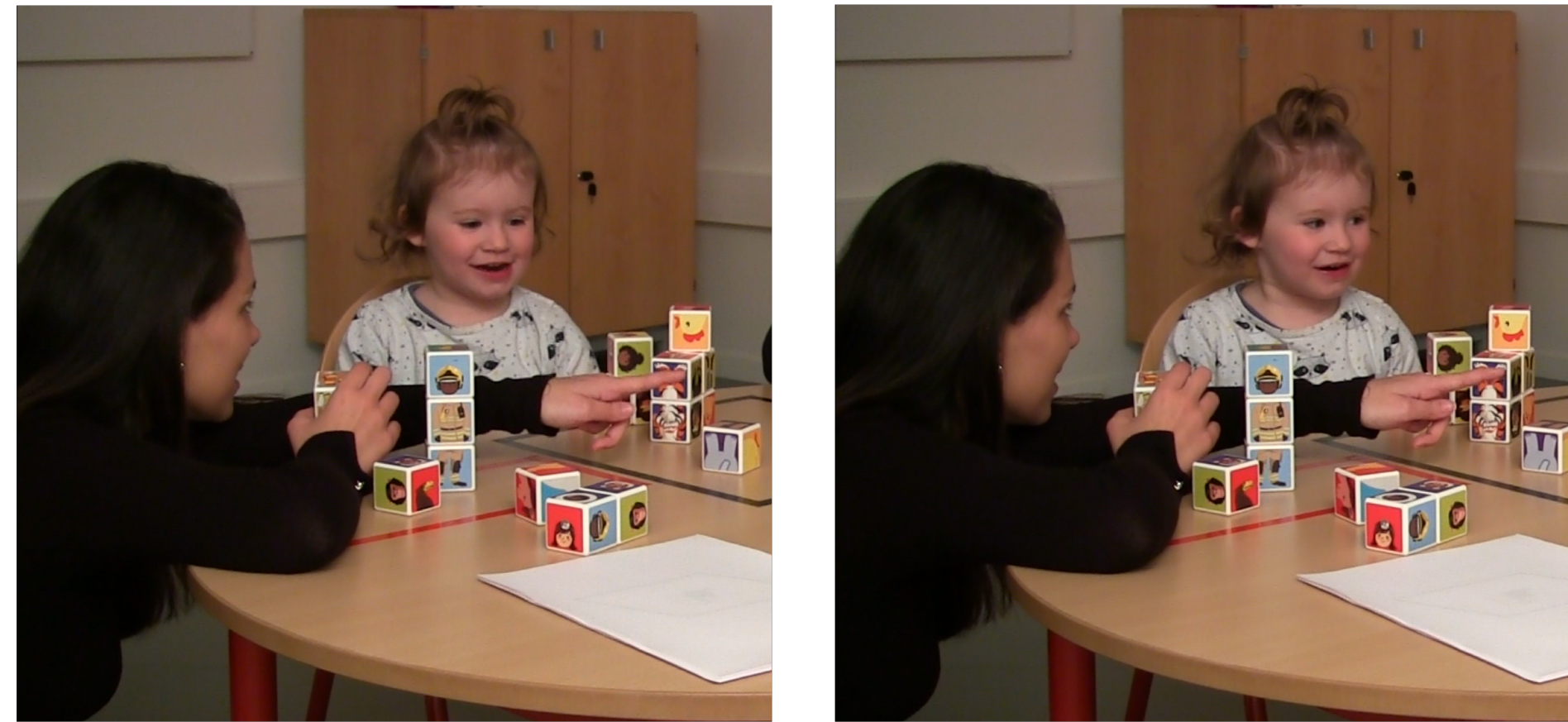
Fig.1: Point following by a 2 years old child.