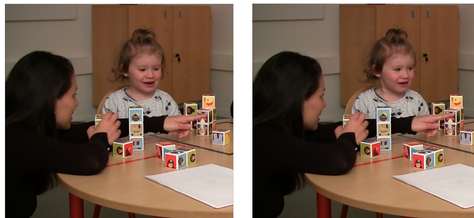
Fig.1: Point following by a 2 years old child.