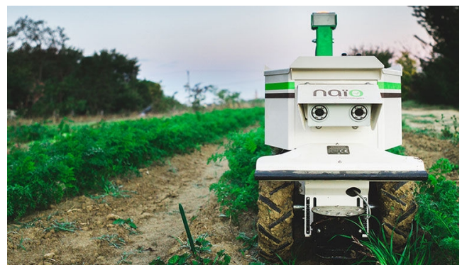
Fig. 2. The weeding robot Oz.

As in any empirical study, there are threats to validity. In construct validity the threats relate to the identification of the faults highlighted by the detected failures. Two secondments in companies, of three months each, have been planned to ensure proper communication and discussion between the researcher and the engineers responsible for the development and debugging. External validity relates to generalizing the results from the two mobile robots cases. The cases of the robots under test exemplify two complementary industrial cases, as they have opposite characteristics: one robot vs multiple robots, outdoor open space vs indoor closed space, and without agents vs with agents. In testing, the approaches for the generation, selection, and analysis that will be adopted are general and can be applied to other cases.