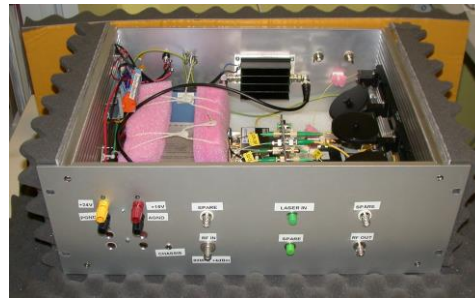
Fig. 1. Optical FM noise measurement system: 2 km delay line frequency discriminator with 80 MHz frequency offset obtained with an acousto-optic modulator. The output signal at 80 MHz is measured on a E5052B RF phase noise analyzer.

The lasers FM noise spectrum is measured using a 2 km delay line self-heterodyne frequency discriminator [1,2]. The system performance has been presented at IFCS 2015 [3]. Since this presentation, it has been improved by replacing the 80 MHz intermediate frequency oscillator by a low phase noise synthesizer, the IF oscillator noise being the limiting parameter at very low offset frequencies (1 Hz to 5 Hz). It has also been improved by protecting the whole system from mechanical and acoustic vibrations, which are still the limiting factor in the 10 Hz to 1 kHz range. This system is shown in Figure 1.