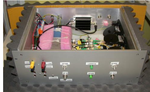
Fig. 1. Optical FM noise measurement system: 2 km delay line frequency discriminator with 80 MHz frequency offset obtained with an acousto-optic modulator. The output signal at 80 MHz is measured on a E5052B RF phase noise analyzer.

The lasers FM noise spectrum is measured using a 2 km delay line self-heterodyne frequency discriminator [1,2]. The system performance has been presented at IFCS 2015 [3]. Since this presentation, it has been improved by replacing the 80 MHz intermediate frequency oscillator by a low phase noise synthesizer, the IF oscillator noise being the limiting parameter at very low offset frequencies (1 Hz to 5 Hz). It has also been improved by protecting the whole system from mechanical and acoustic vibrations, which are still the limiting factor in the 10 Hz to 1 kHz range. This system is shown in Figure 1.