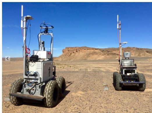
Fig 1: the robots Minnie and Mana

The dataset has been gathered with the two mobile robots Mana and Minnie (Fig. 1), Mana being equipped with a panoramic Velodyne HDL64 Lidar, and Minnie with three stereoscopic benches (one mounted on a orientable turret on top of a mast, two large field of view benches looking forward and backward), and a panoramic Velodyne HDL32 Lidar. Both robots are endowed with wheel odometry, a high-end FoG gyro, a low cost IMU, and a cm accuracy RTK GPS for pose ground truth.