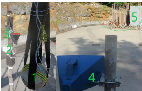
Fig 2 Platform used here for investigating the transmission through HE fireballs of two microwave FM carrier frequencies of 4 Ghz and 5 Ghz. The HE charge (1) is placed at 0.5 m from the pressure sensor (3). The VCO and the half-wave dipole antenna are protected by a dielectric package (2) and are located at 0.8 m from the center of the charge. The horn Rx-antenna (4) is placed at 20 m from the Tx-unit and the HE charge (5).

The wireless setup is installed on a platform used for studying structure vulnerability and explosive detonation (see Figure 2). PCB 113A34 piezoelectric pressure sensors in side-on configuration are deployed around a spherical HE charge. For comparison purpose, both the wireless and wired transmission of pressure signal delivered by two sensors located at equal distance of 0.5 m from the charge. To prevent from interaction with the shockwave generated by the explosion, the VCO and Tx-antenna are placed at 0.8 m from the charge. Moreover, in order to protect the electronic devices and half-wave dipole antenna of the Tx-unit from eventual damage caused by ionized gases and/or high temperatures, a robust dielectric Acrylonitrile Butadiene Styrene (ABS) package (transparent to microwaves) has been used. Each detonation experiment is recorded using ultra-fast cameras in order to estimate, in particular, the time at which the sensors are inside the fireball.