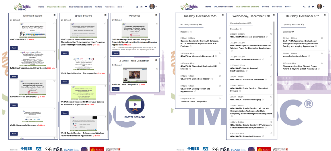
Figure 2. The interfaces of on-demand and live scheduled sessions.

The on-demand sessions, which were composed of pre-recorded presentations of the accepted technical papers, were made available to attendees by Dec. 9th, i.e., a few days ahead the start of the conference to allow watching the presentations in advance. The live sessions were scheduled during the afternoons, Central European Time, from Dec. 15th to 17 th , to enable participants from all over the world to attend the conference together. These live sessions were dedicated to the plenary sessions, the keynote and invited presentations as well as the Questions and Answers of the technical sessions to enhance discussion between all participants.