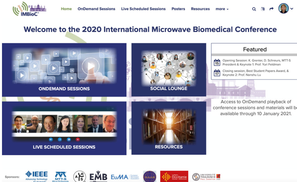
Figure 1. A view of the IMBioC 2020 online conference interface.