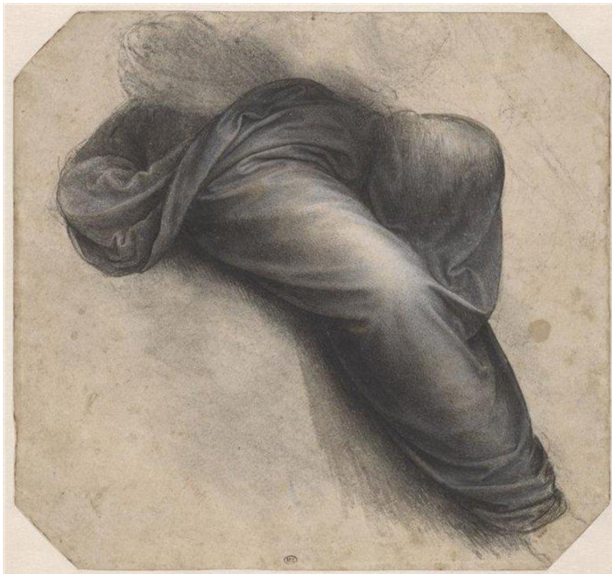
Fig. 8. Leonardo da Vinci, study for the mantle of the Virgin, Le Louvre, Paris

Between 1508 and 1509, Leonardo continued to study turbulences around obstacles and at the bottom of waterfalls. In particular, turbulences are represented in details in the manuscripts on hydrodynamics W. 912579r (Fig. 7) and W. 912660v to W. 912662 of the Royal Collection, Windsor and Manuscript MS 2177 48r of the Bibliothèque de l'Institut de France, Paris. Motifs related to instabilities and turbulences appear also in the ridge folds over the thigh and near the back of the Virgin in the study of the mantle of the Virgin, ca. 1507-1510 by Leonardo (Fig. 8). El Baz has noted that this mantle recalls Greek mantle ( "himatia" ) and is similar to the one