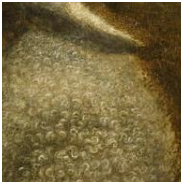
Fig. 5. Detail of the lamb in Le Louvre painting

Turbulence has been extensively studied by Leonardo. Before the end of the fifteenth-century, Leonardo draw turbulent motion of water around obstacles like in the Manuscript MS 2179 16r (ca. 1493-1494) of the Bibliothèque de l'Institut de France, Paris (Fig. 6).