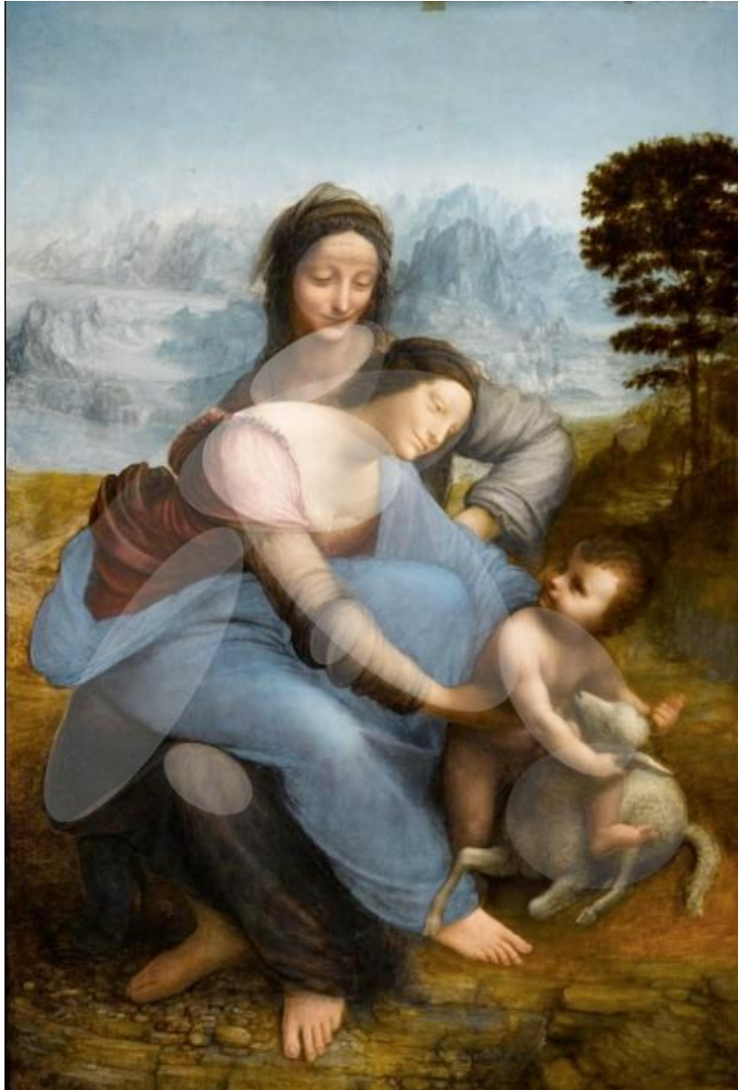
Fig. 2. Examples of ellipses (in light shade) or portions of ellipses in the composition of Le Louvre painting

we note that the directrices of these conics are not organized according to a given pattern. In particular, the different conics seem to have no relationship with the pyramidal structure that was pointed out previously in the literature.