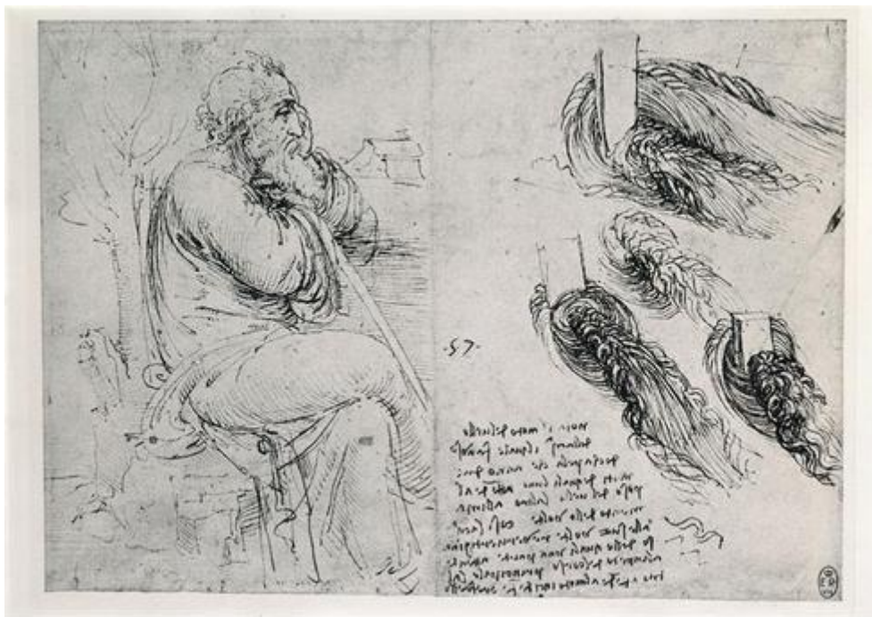
Fig. 7. Manuscript W. 912579r of the Royal Collection, Windsor (ca. 1508-1509)