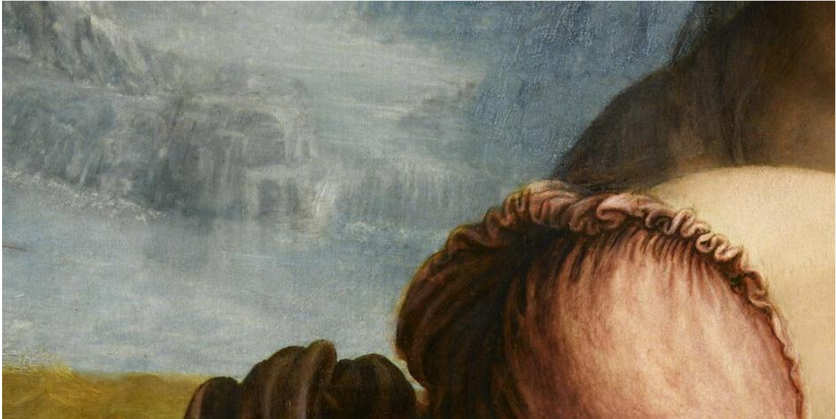
Fig. 4. Detail of the ornament of Virgin dress in Le Louvre painting