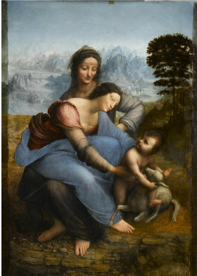
Fig. 1. Da Vinci, Leonardo. Virgin and Child with Saint Anne , oil on wood, Le Louvre, Paris.

The characters are organized in two distinct couples, namely the Saint Anne and Virgin couple, in the center of the panel and the Child and lamb couple, to the right. This process introduces some elements of symmetry that contribute to structuring the composition, especially with regard to the arrangement of the heads of the characters. To the symmetry of roles of the two mothers with miraculous succession according to the tradition, responds that of the two creatures called to sacrifice. These elements of symmetry greatly participate to the harmony of the panel.