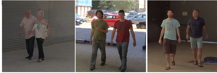
Fig. 1. Examples of human-human accompaniment relations. Left: a couple, center: friends, and right: colleagues. Notice: These images are from an own data set of our institute included in [6]. The provided one from [7] only includes the numeric data about the people tracks.

of social robots capable of accompanying pedestrians where the robot should be adapted to allow more human, predictable, and comfortable accompaniment behaviors. To do so, the classification of these human social relationships while they walk together is crucial to be able to include this human behavior, in the future, in the accompaniment behavior that the robot will carry out with its companions.