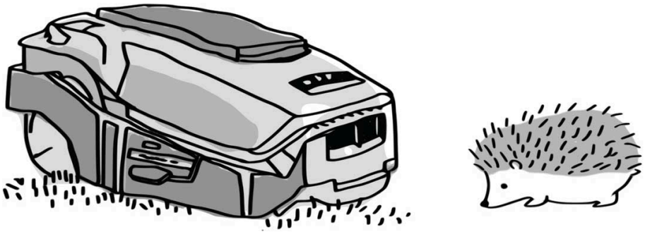
Figure 3. Robots versus Hedgehogs. In Europe, various debates have emerged about the measures and actions to be taken in order to protect the small mammal from the robot lawn mower. (© Pieters)