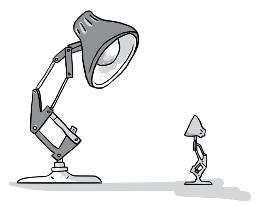
Figure 1. While some lamps are put in motion in an animated movie, they expose the importance of movement in humans' perception.

such a principle as it records movements. In this way (or with similar techniques), we also enjoy a shy , nervous , or playful lamp in an animated movie. (see Figure 1)