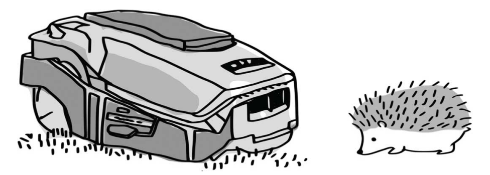
Figure 3. Robots versus Hedgehogs. In Europe, various debates have emerged about the measures and actions to be taken in order to protect the small mammal from the robot lawn mower.