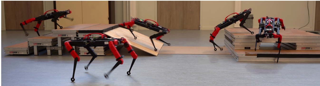
Fig. 1: The open-hardware quadruped robot Solo-12 trained with CaT performing agile locomotion over challenging terrains while satisfying safety and style constraints. The robot can walk up stairs, traverse slopes, and climb over high obstacles.

Elliot Chane-Sane *1 , Pierre-Alexandre Leziart *1 , Thomas Flayols 1 , Olivier Stasse 1,2 , Philippe Souères 1 , Nicolas Mansard 1,2