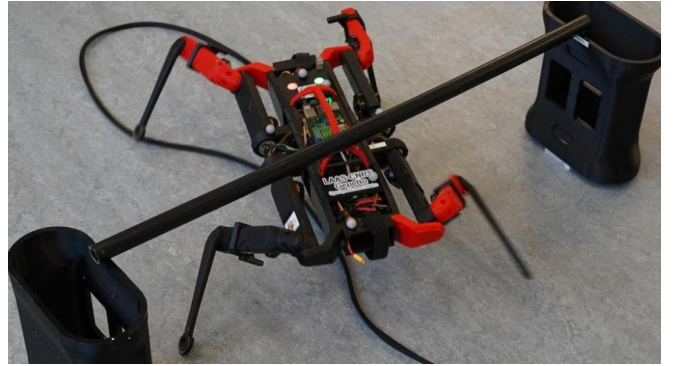
Fig. 5: CaT trained with a constraint that limits the height of the base learns crouching locomotion skills.

We then compare CaT to always enforcing style constraints, even on challenging terrains ( Style always active ). While this approach successfully learns walking skills on flat and rough terrains, it struggles on more difficult ob-