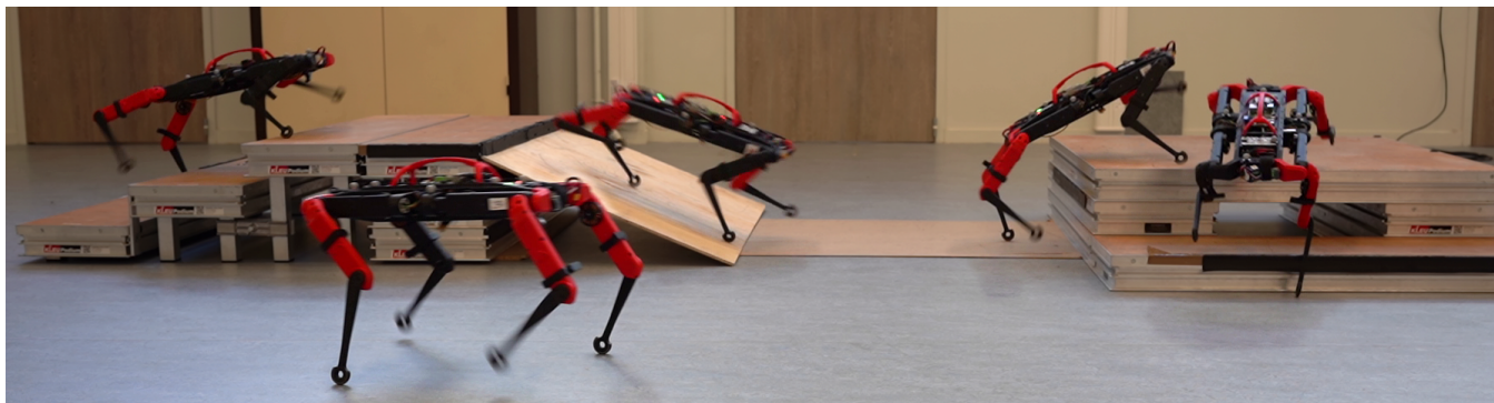
Fig. 1: The open-hardware quadruped robot Solo-12 trained with CaT performing agile locomotion over challenging terrains while satisfying safety and style constraints. The robot can walk up stairs, traverse slopes, and climb over high obstacles.

Elliot Chane-Sane *1 , Pierre-Alexandre Leziart *1 , Thomas Flayols 1 , Olivier Stasse 1,2 , Philippe Souères 1 , Nicolas Mansard 1,2