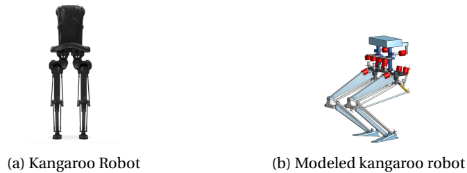
Fig. 3: Real and modeled robot. The model is presented with open 6D and 3d contact constraint

Kangaroo, a high-dynamic humanoid from Pal Robotics, features legs actuated by 6 linear motors. Its complexity surpasses Digit, as all actuators are in the hips, resulting in 12 kinematic closures (Fig. 3). The real and modeled robot are presented in